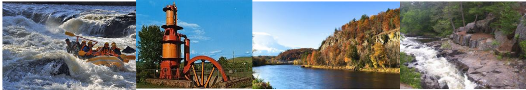
Michigan Earth Science Teachers Association in cooperation with Wisconsin Society of Science Teachers

Integrated science with real world connections, plus a lot of fun !!